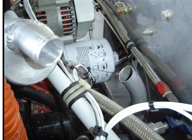
Figure 2: Removal of excess firewall drain tubing.