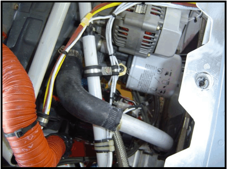
Figure 1: Stock Assembly