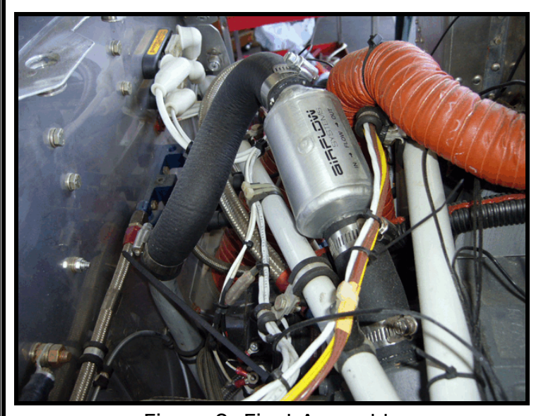
Figure 3: Final Assembly